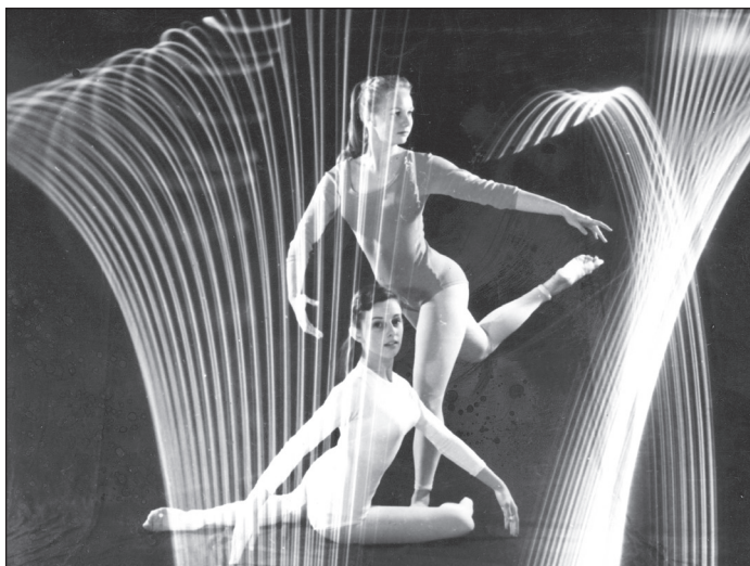
Dancers surrounded by an electronic image, 1964.

The secret marriage , which employed startlingly new, modified light settings and modulations. He designed the set for a new, light/colour abstract presentation for two performances of the South Australian Ballet Theatre. His innovative techniques were then used by the Elder Conservatorium in their Opera Workshops. Among other theatrical events, he staged a visual production on the theme of Orpheus, using dance, music and voice with several projectors. This was the first attempt at quadrasonic sound in Australia, and also the first demonstration of