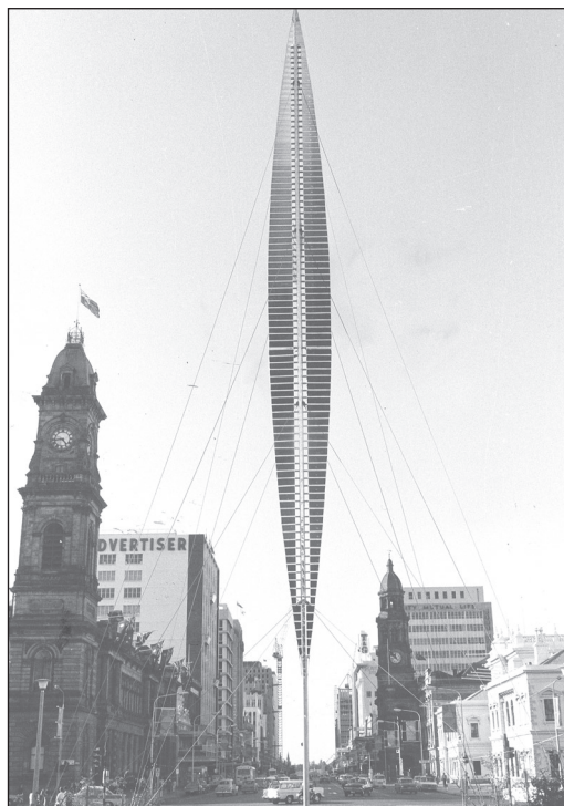
The chromasonic tower translated music and sounds surrounding it into lights at night. Adelaide, 1970.

In 1975 the Laser-Chromasonics and Chromasonic Tower Mark II were exhibited at the Festival of Creative Arts and Sciences in Canberra entitled Australia '75 . At the Royal Adelaide International Exposition '78 the