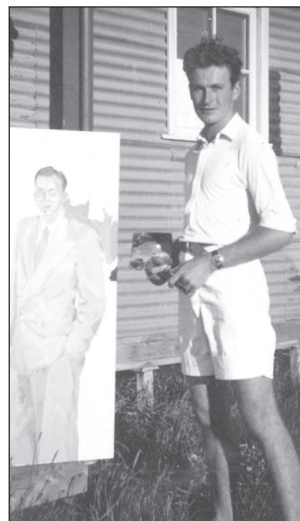
Ostoja-Kotkowski painting at Bonegilla migrant camp, 1949.